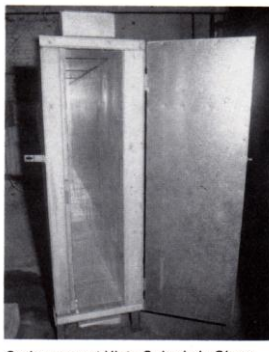
Curing oven at Vista Color Lab, Cleve land, Ohio, is big enough to handle the largest sheets of plastic being used.