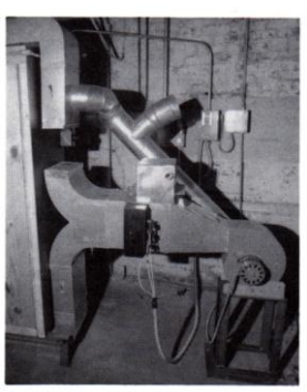
Heating element and blower should include a high-temperature cut-off ther mostat as a protective device.