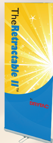
The Retractable II™