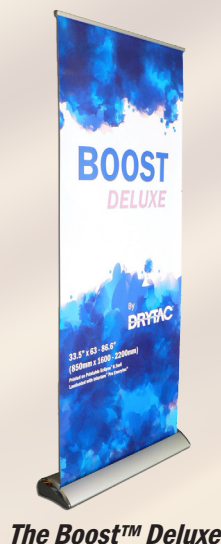
The Boost™ Deluxe